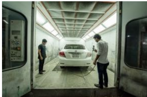
Paint work ongoing in fully equipped paint booth

No single automotive trader in Bangladesh has such comprehensive workshop and support engineering facilities at one place, which will cater all the technical needs of the customers. This facility is now being considered to be expanded and optimally used for other commercial/Industrial operations, like reconditioning of automotive vehicles, using the bonded house concept. Haq's Bay is also