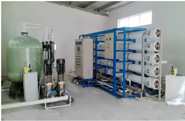
Pic.2 Reverse Osmosis Cleaning Equipment

Reverse osmosis technology is the most modern method that uses the principle of water molecules passing through a semi-permeable membrane under the influence of external pressure. With the help of the reverse osmosis process, it is possible to get rid of 98% of impurities dissolved in water (in industrial installations, the figure can reach 100%).