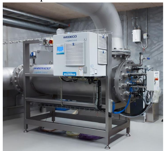
Pic.3 UV sterilizer

Pathogenic microorganisms can harm the human body only if they multiply in the body; when water is disinfected with ultraviolet light, this ability is lost and, as a result, any negative effect of microorganisms is excluded.